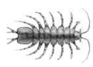
Aquatic sow bug

Mile 14—Bald Eagles & Ospreys —During scouting trips through this section, we spotted both ospreys and bald eagles. You will see the ospreys soaring above the water, sometimes hovering, before they plunge to the water to capture their quarry. Bald eagles are less industrious. They routinely steal fish caught by ospreys. Bald eagle populations have rebounded since the 1970s, but since 1995, 45 bald eagles have perished at Clarks Hill Lake, the result of a mysterious neurological disorder called AVM -- or avian vacuolar myelinopathy. In January, biologists counted 8 eagles during an annual survey of the lake—half the number spotted in 2009.