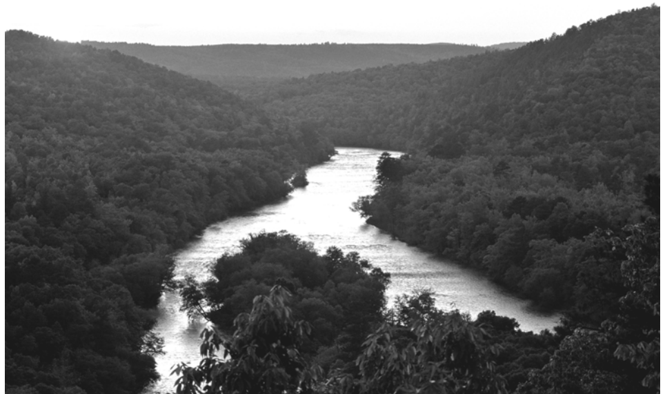
The Flint River at Sprewell Bluff.