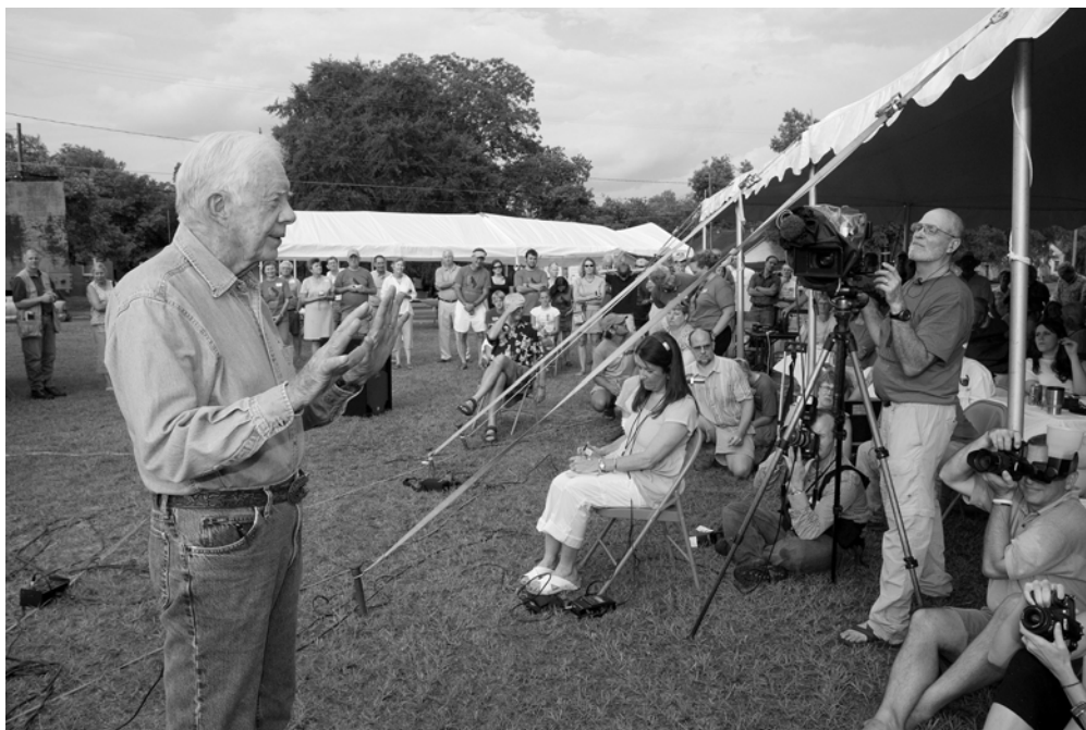
President Carter addresses paddlers and Flint River supporters at the Paddle Georgia End of Trip Celebration in Oglethorpe, GA.

The River and Harbor Act of 1945 authorized three power-storage reservoirs on the Flint River above Albany - Sprewell Bluff, Auchumpkee Creek and Potato Creek. The most controversial was Sprewell Bluff, a popular scenic and fishing spot on the Fall Line that Paddle