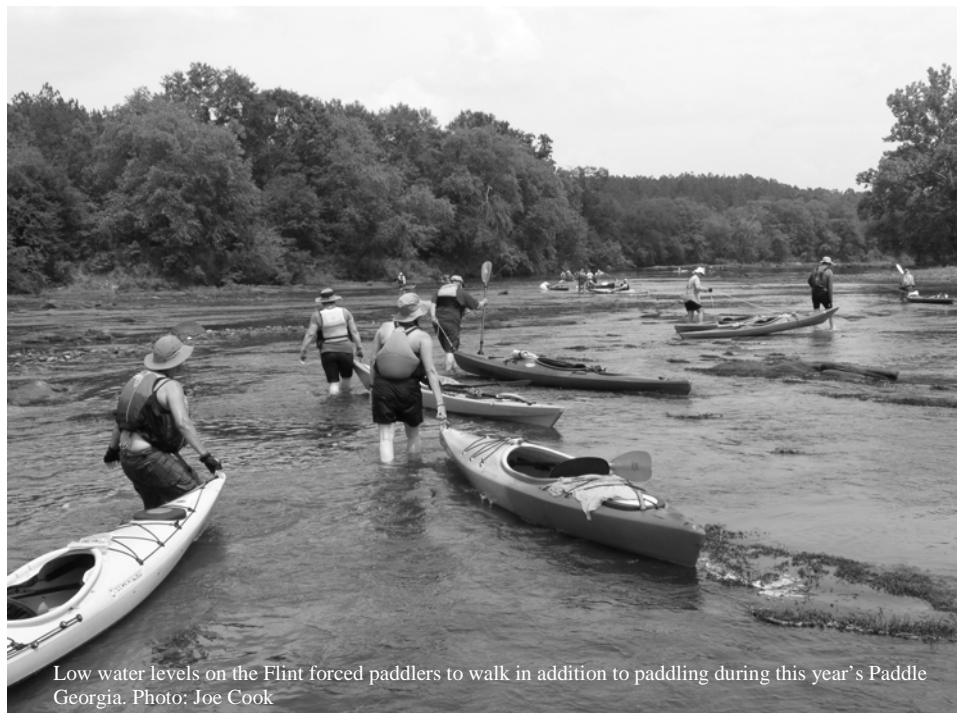
Low water levels on the Flint forced paddlers to walk in addition to paddling during this year's Paddle Georgia.

www.conservewatergeorgia.net/Documents/wcip.html