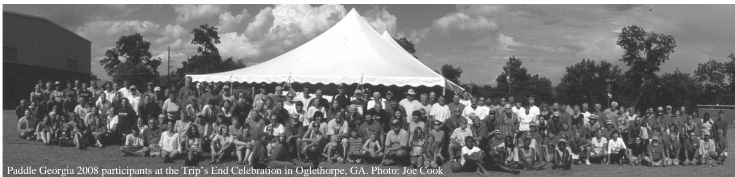
Paddle Georgia 2008 participants at the Trip's End Celebration in Oglethorpe, GA.