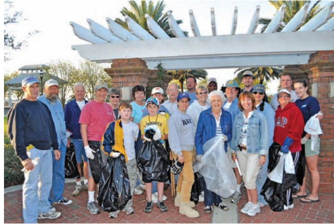
St. Mary's Earthkeepers at a recent river clean up.