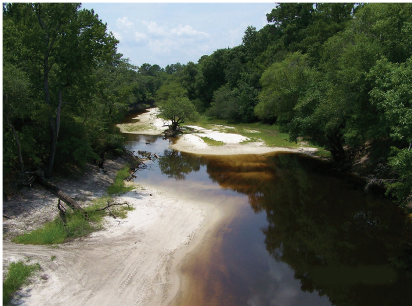
Satilla River at US 1 bridge north of Waycross. Several Redbreast beds lie within 10 feet of the ATV tracks.

"Down in South Georgia, people were riding their ATVs on the banks and in the river when it was low enough in the summer. Up in those north Georgia trout