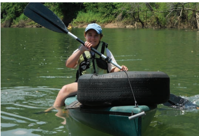
Paddle Georgia participant brings in a tire on river clean up day.

Potsherds, Pop Tops and Pop Bottles: The Oconee's sandbars (and its eroding banks) held many treasures, spanning more than 1,000 years of the region's cultural